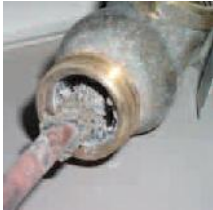
This temperature and pressure relief valve is clogged with hard scale.