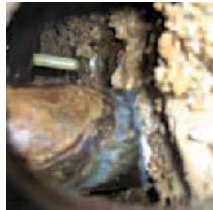
Large deposits of hard scale constrict water flow in this hotel plumbing system.