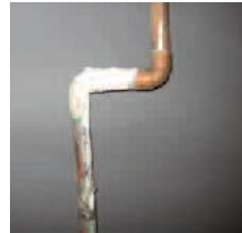
Hard scale build up on the exterior of copper pipe in a plumbing system.